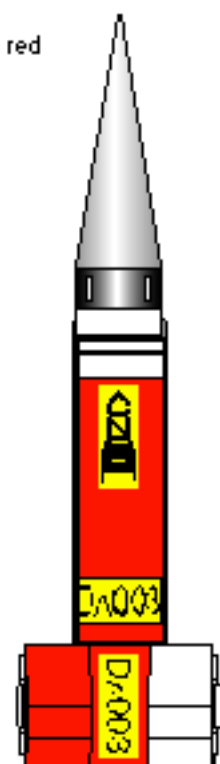
Two white fins Two red fins